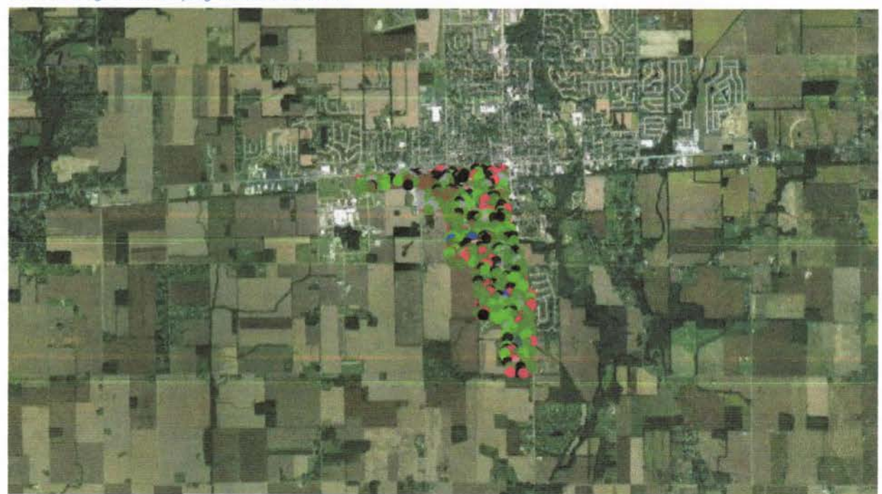
Report a map error